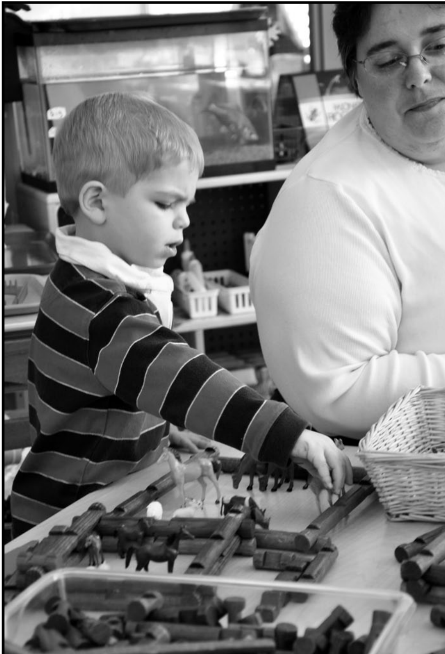
Subjects & Predicates

Provide all children with rich and varied opportunities to demonstrate their learning. Find methods that focus on understanding how children use the knowledge and skills they are learning within the context of everyday routines and activities.