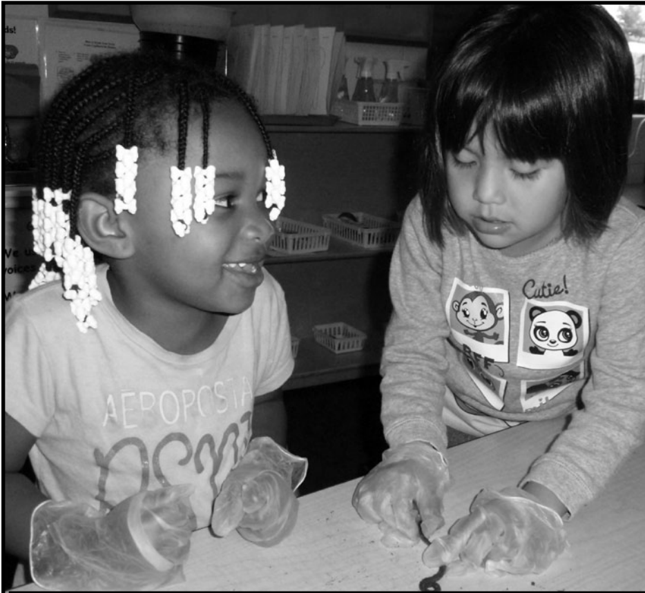
Subjects &amp; Predicates

Some children learn better by listening, others learn better by seeing, still others learn better by doing. Most people, including children, learn best from a combination of all these approaches. The concept that learning is multisensory is built into every appropriate early childhood curriculum.